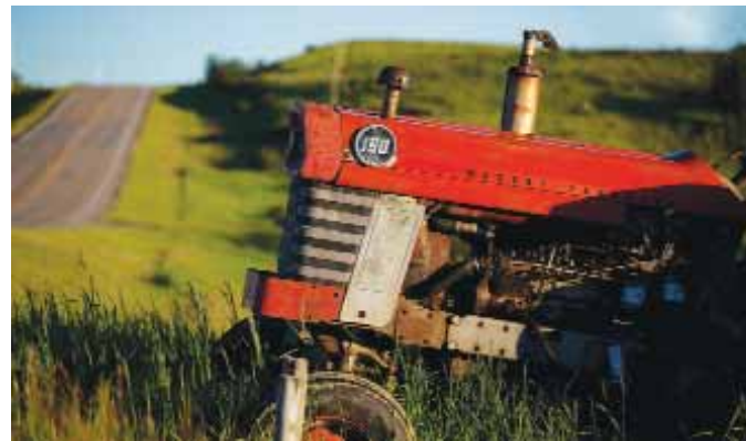
Calgary, Alberta, Canada

or the 100,000 lakes and rivers with more sunshine per year that is of importance to you; the whole is greater than the sum of its parts, which means that it is not any one of these individual items that makes Saskatchewan great – it is all of these factors put together.